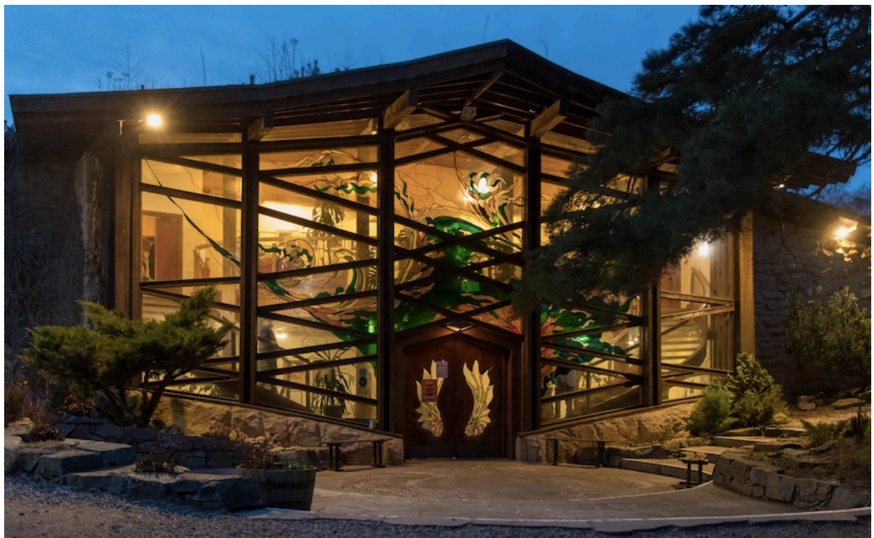
The Universal Hall

for long term movement practitioners who yearn to deepen and expand their personal movement practice by sharing that practice, as well as veteran space-holders who desire camaraderie and safe place to practice the next level of their art and craft.